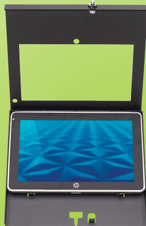
HP SLATE 2®

“The ATRIO Tablet Enclosures will secure and protect iOS, Android, or Windows-based tablets in any application setting.”