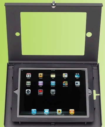
iPad 2 & The New iPad®